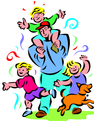
FALL HOA PICNIC AT GCC 4 PM

The Fall Picnic get-together for the neighborhood is planned for September 26th beginning at 4pm at the Georgetown Country Club Dining room. Food and fun will be provided and swimming is available for HOA members and their families. Admission for non-member's will be $5 per family and $4 per person for swimming.(children