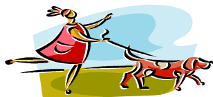
Wear light colored clothes at night for visibility.