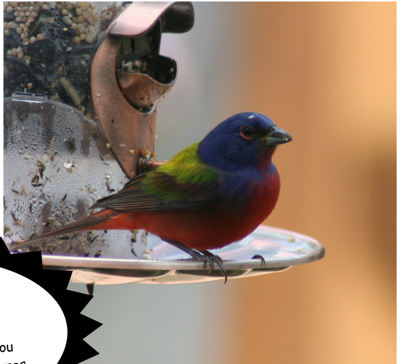
A Painted bunting visiting my backyard feeder. contact the HOA email if you want your neighborhood pictures featured in the newsletter!